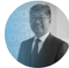
Young Tae Kim

Total transport activity will more than double by 2050 compared to 2015 under the current policy trajectory. Existing transport decarbonisation policies will be insufficient to pivot passenger and freight transport onto a sustainable path. By contrast, more ambitious yet realistic transport decarbonisation policies could reduce transport CO2 emissions. ITF Secretary-General Young Tae Kim will provide insights into how the challenges that policy makers face can become opportunities for creating truly sustainable and inclusive transport systems.